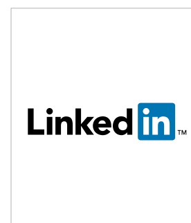
Follow us on LinkedIn: linkedin.com/showcase/cms-tax