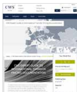
CMS Expert Guide to International Transfer Pricing Documentation