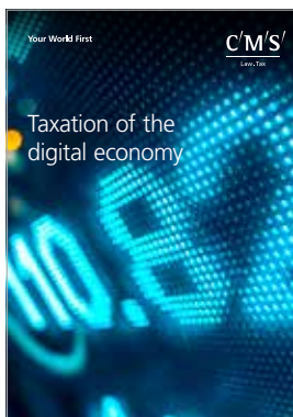
Taxation of the digital economy

We know how important it is to share our know-how with our clients. We invest significant resources in producing thought leadership publications and Expert Guides, articles and news flashes.