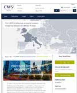
Post BEPS intellectual property taxation