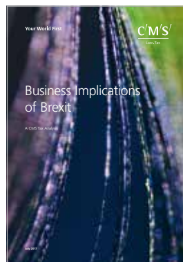
Business Implications of Brexit