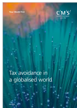
Tax avoidance in a globalised world