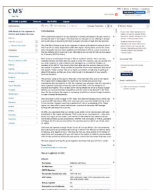
CMS E-guide on tax regimes in Central and Eastern Europe covering 15 jurisdictions

CMS tax lawyers have also developed dedicated thought leadership initiatives in the energy sector and have devoted a specific sub-group of experts to act on subject matters for M&A transactions.