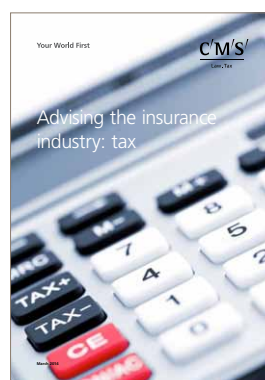
CMS brochure on Advising on the insurance industry: tax