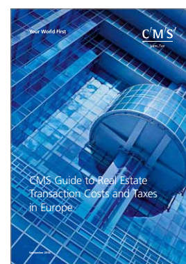
CMS Guide to Real Estate Transaction Costs and Taxes in Europe