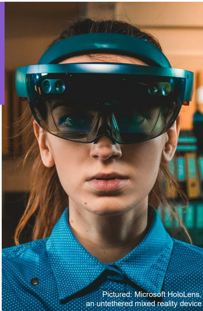
Pictured: Microsoft HoloLens, an untethered mixed reality device