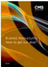
Business Restructuring – How to get out alive?

You can access our guides and publications at cms.law . Recent examples include: