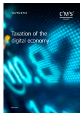
Taxation of digital economy