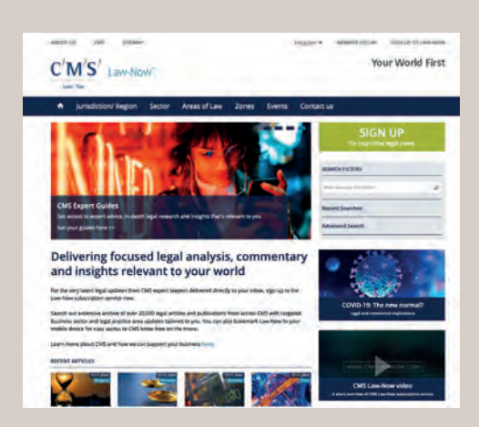
Law-Now : a multilingual legal and tax news alert system covering 29 jurisdictions.

You can also go to Law-Now (cms-lawnow.com), our services providing legal and tax news and alerts.