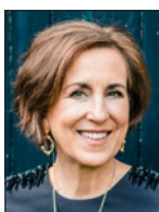
Kirsty Wark Broadcaster and Journalist